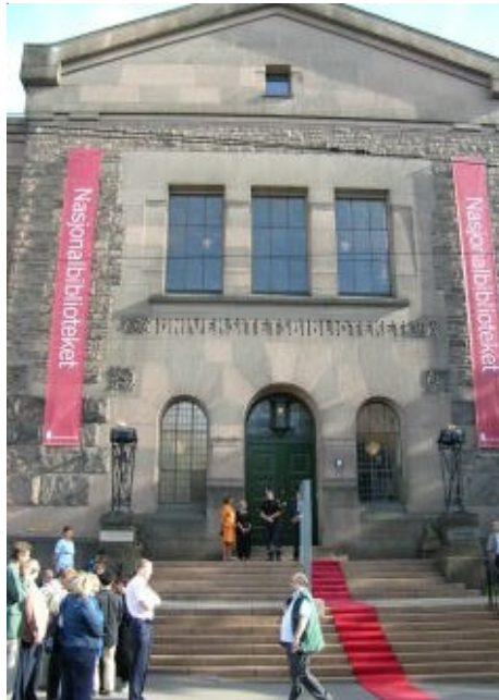
National Library of Norway

Preceding the conference, the students participated in a three-day seminar developed by the Higher Education Consortium for Urban Affairs (HECUA), of which St. Catherine's is a member. The seminar focused on library services to new immigrants and allowed the students to compare U.S. library services to new immigrants, especially those provided by public libraries in the Twin Cities, to those of the Scandinavian countries, Norway in particular. As part of the seminar, students